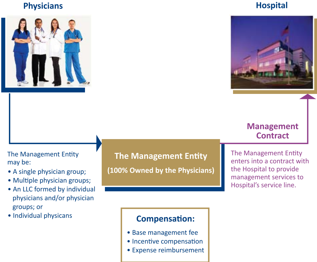
Diagram 2: Service Line Management Without a Joint Venture